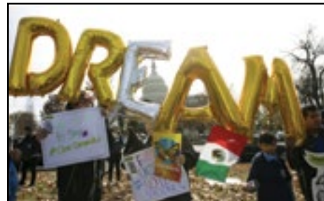
Demonstrators on December 6 hold up balloons during an immigration rally in support of the Dream Act and Temporary Protected Status programs, near the U.S. Capitol.

For more information and an on-line option for contacting your representative: http://www.lawg.org/action-center