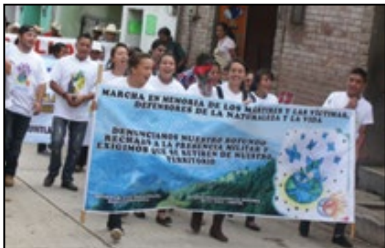
March in memory of martyrs and victims, defenders of nature and life. We express our firm opposition to the presence of the military and we demand that they leave our territory.

ROCLA's 30th Annual Rice & Beans Dinner with our Live and Silent Auctions is coming up Friday, April 6, 2018! After the Holidays is a great time to begin that New Year's resolution to declutter and part with items you no longer need—they might find their way into someone else's heart via ROCLA's auctions. All items must be in good condition. Suggested items to donate include paintings, art prints, quality posters, books, toys, side tables, chairs, jewelry, candelabras, pottery, good picture frames, skates, sports gear and other such items in good condition, textiles, etc. You can also donate a service such as knitting lessons, babysitting, help with taxes, etc. If you want to donate an item that you value at over $100, it will be included in the Live Auction. Please don't contribute clothing or shoes. In the next edition of the ROCLA newsletter, we will provide details about who to contact and where to drop your items. All auction proceeds support ROCLA's programs and organizations working in Latin America.