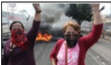
State of emergency in Honduras over protests following election fraud.

dency of the vote count reported before and after that delay, raised serious doubts about the integrity of this election.