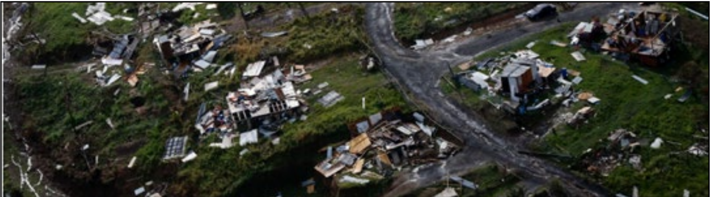
Damage in Puerto Rico after Hurricane Maria.

Much is happening in several countries in Latin America and the Caribbean as a result of changing U.S. policies and other factors such as elections, hurricane damage and right-wing instigated violence. Here we survey some of those important developments. On page 5, we list some of the Urgent Actions you can take to oppose the U.S. policies fueling these events. [Ed.]