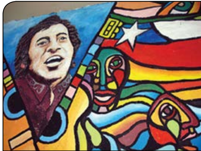
Victor Jara Mural in Santiago, Chile