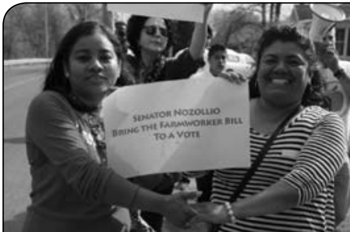
Farmworker advocates visit Sen. Michael Nozzolio's (R-54th) office.