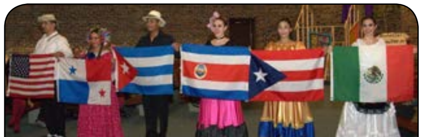
Finale of Latinos de Corazón Dance performance.