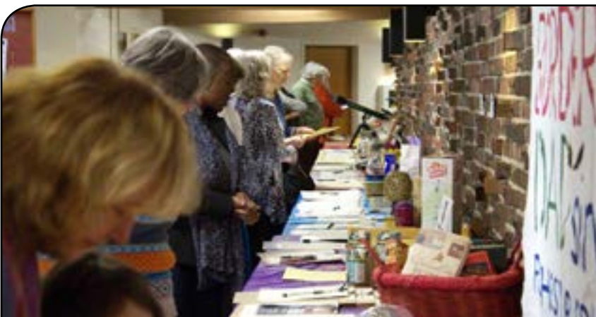
Dinner guests look over the many Silent Auction offerings.