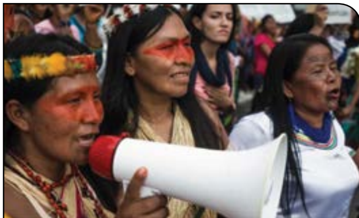
Indigenous women of the Amazon protest.