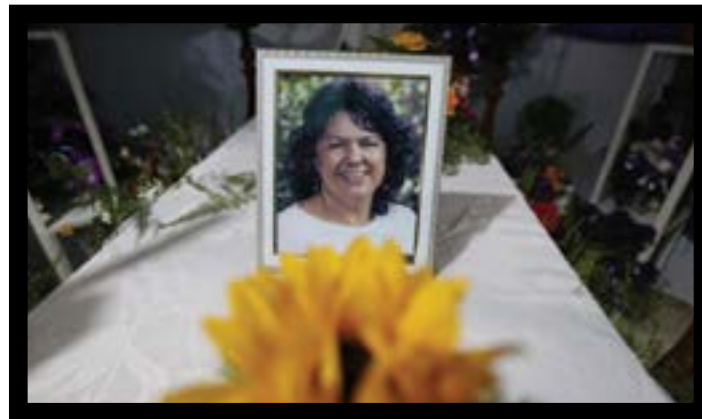
A photo of Berta Cáceres graces her coffin.

She was killed ... by 500 years of European racist, violent, dispossessing imperialism, by 200 years of