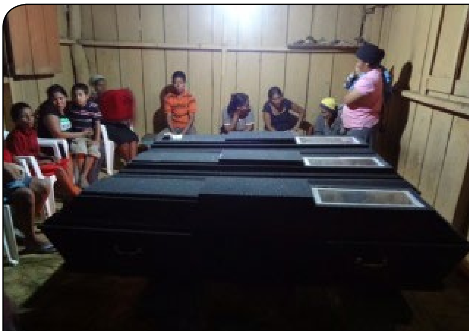
Family members hold vigil for the three men killed in Locomapa, Honduras.