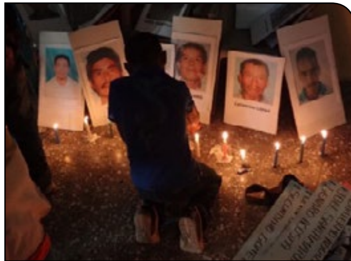
Honoring those killed in Honduras.