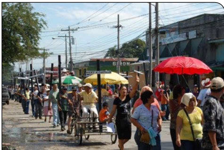
March honoring the dead with crosses in Honduras.